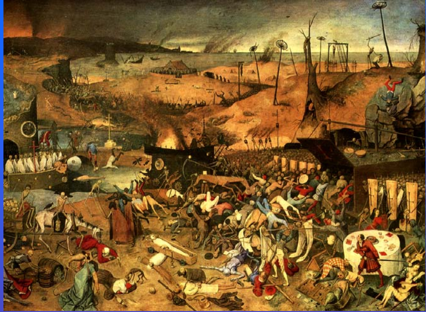
P. Bruegel the Elder 'Triumph of Death' (1565)

Geneva, which stressed self-restraint, thrift and hard work, and abhorred pleasure & frivolity- to a Catholic sense of sin, was added a sense of duty.