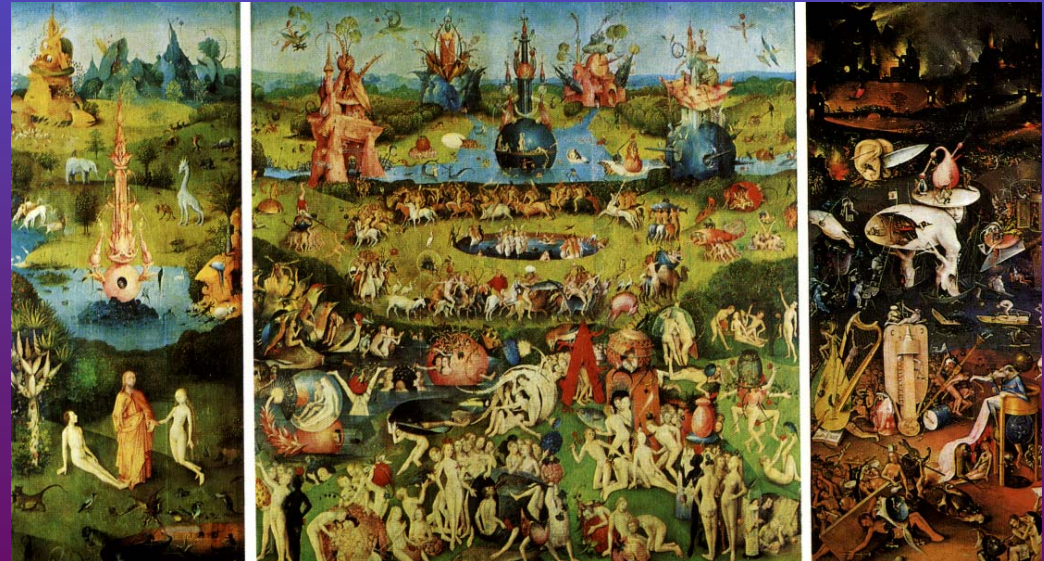
Above & right: 'Garden of Delights', H. Bosch (c. 1500-10)