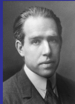
N Bohr in 1916

'The essentially new feature of the analysis of quantum phenomena is, however, the introduction of a fundamental distinction between the measuring apparatus and the objects under investigation. This is a direct consequence of the necessity of accounting for the functions of the measuring instruments in purely classical terms, excluding in principle any regard to the quantum of action' (Bohr 1959).